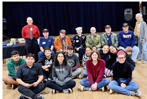
Freedom Committee veterans visited Early College High School on December 2nd....