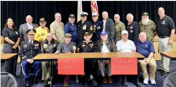
On January 15th, 17 veterans of the Freedom Committee met at Back Bay High School for interviews with small groups of students.