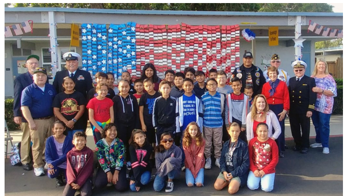
Sonora Elementary School Veterans Day ceremony