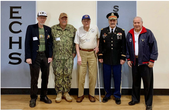
Five veterans attended Early College High School,