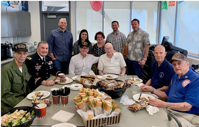
After their presentations, the veterans were treated to lunch by the school.