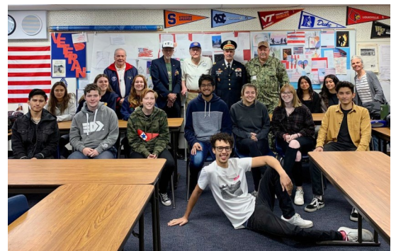
...and again on December 3rd.