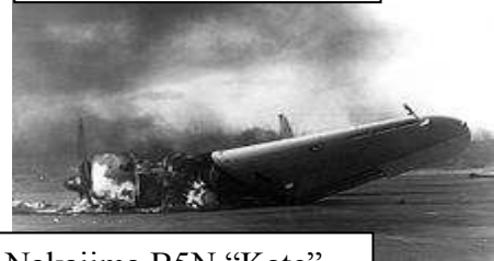
Burning SBD at Ewa