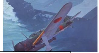
"Kate" torpedo bomber.