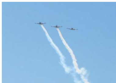
Fly-over in the Missing Man formation