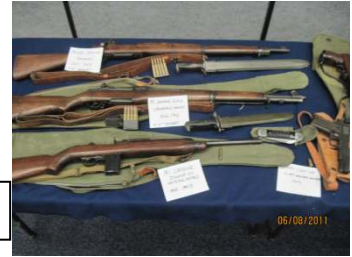
Middle-M1 Garand. Bottom-Carbine