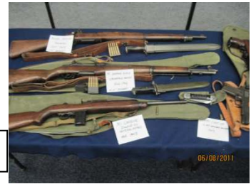
Middle-M1 Garand. Bottom-Carbine