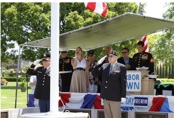
Posting the Colors