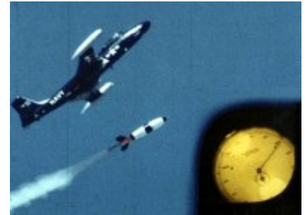
Loft-Toss method of bombing

had a yield of 17-18 kilotons (kt) and weighed 8,900 lbs. The Mark 7 was a tactical weapon that could be "dialed" to yield between 8 to 61 kt. The Mark 7 was designed to be carried in an external fuel tank attached to the F-84. The nuclear portion of the bomb was about the size of a soft ball. There were two methods a dropping the weapon. The loft-toss was a low level approach and a sudden 4G pull-up into a