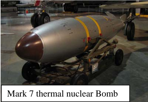
Mark 7 thermal nuclear Bomb

Then the 20 th was trained on bombing tactics using thermal nuclear bombs AND surviving . The nuclear bomb had to be redesigned so that it could be attached to a fighter. "Little Boy", the atomic bomb dropped on Hiroshima, was carried in a B-29 Bomber,