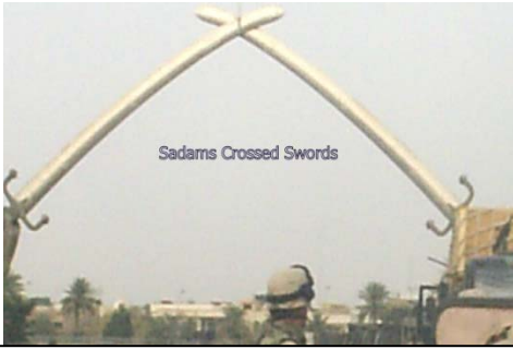
Sadam's Crossed Swords in Baghdad