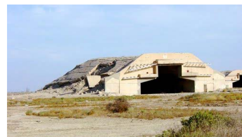
Sadam’s harden bunker at Tallil Air Base after an air strike.