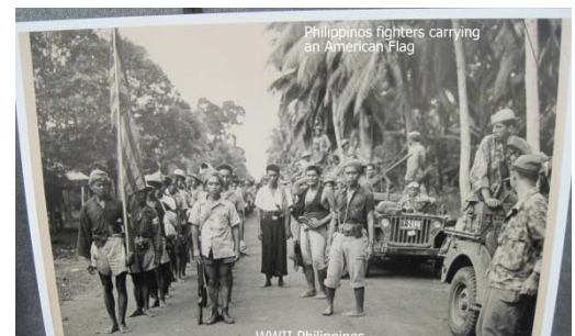
Philippine guerilla army marching with an American flag.