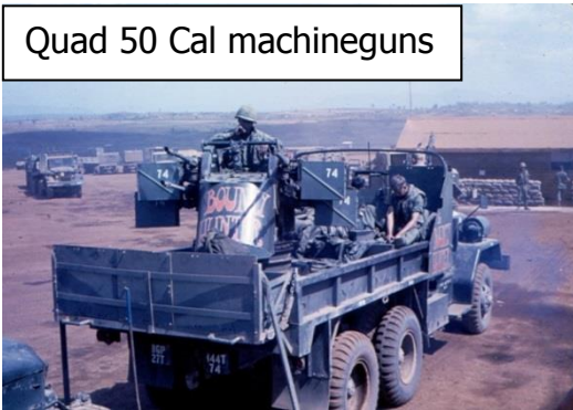
Quad 50 Cal machineguns

Duster covered the left side of the road while the rear track covered the right side. Dusters caught in an ambush pulled off the road, traversed their guns and provided covering fire for the convoy's other vehicles as they hurried to escape the kill zone. The tactic was effective, but it meant Duster crews spent eternities in the kill zone. Firepower wrecked the VC, who never really recovered from their losses in the 1968 Tet Offensive, and it made the trip south down the Ho Chi Minh Trail a one-way journey for the typical NVA recruit.