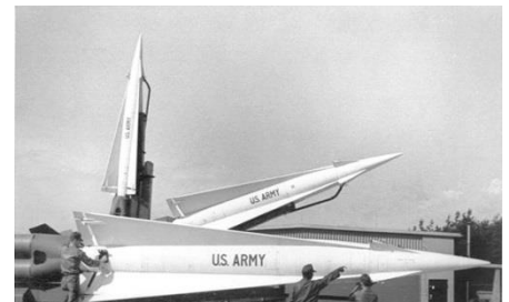
Nike Hercules Missiles