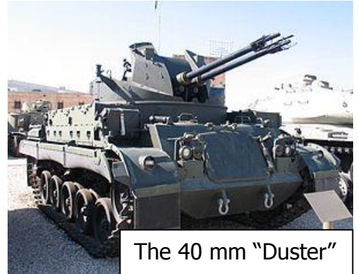
The 40 mm "Duster"

The Dusters and Quad 50s added their fire to the tremendous volume of fire American units expended in Vietnam. Convoy duty was dangerous and nerve racking. Lt Wickersham unit was assigned to Highway 19 and the treacherous Mang Yang Pass near An Khe. Normally, the lead