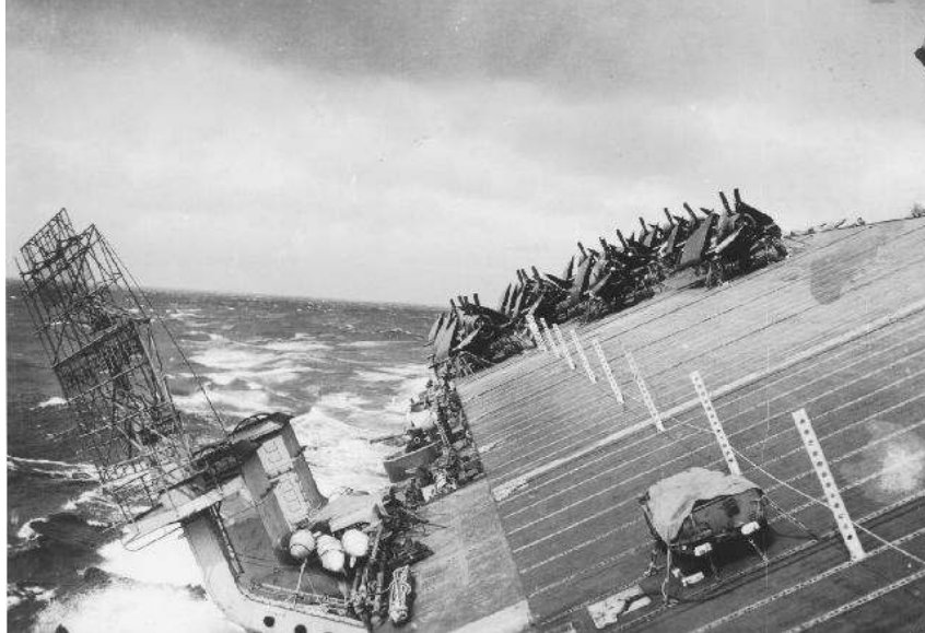
A view of the Cowpens flight deck facing aft from the island around the time Typhoon Cobra hit.

The USS COWPENS is named after the Revolutionary War Battle fought on January 17, 1781, at the “Cowpens,” in South Carolina. On that field of battle, 300 Colonial soldiers met and defeated the superior force of British Army troops. The victory at Cowpens, gave the American Army the courage to successfully pursue the British from South Carolina to Yorktown. The USS Cowpens was in many battles but the worst damage she suffered was from a typhoon.